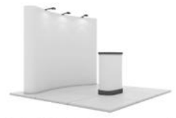
Standard Package (image not contractual)