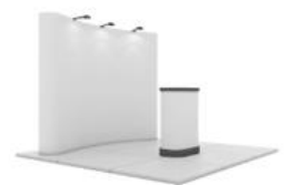
Standard Package (image not contractual)