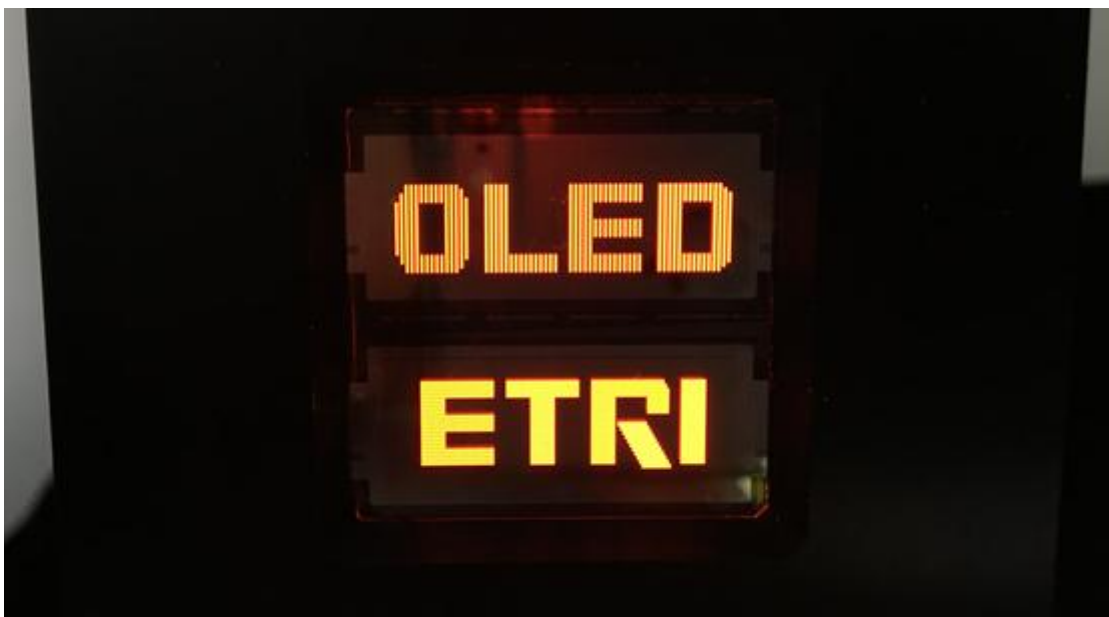
Figure 2. The demonstration of OLED display with graphene pixel electrodes