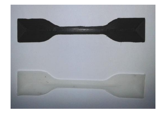
b) Tensile test samples manufactured by 3D printing