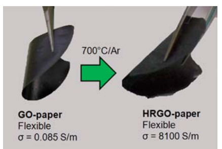
Figure 4: Processing of GO paper-like material into flexible conductive RGO paper-like material.