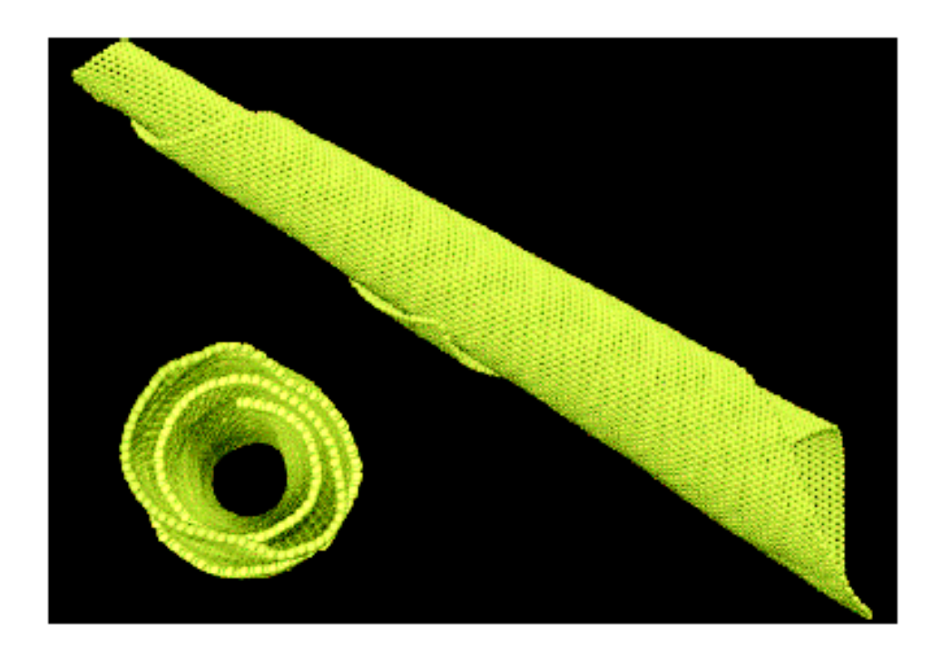
Figure 1 . Three dimensional view of a Carbon Nanoscroll obtained from molecular dynamics simulations.