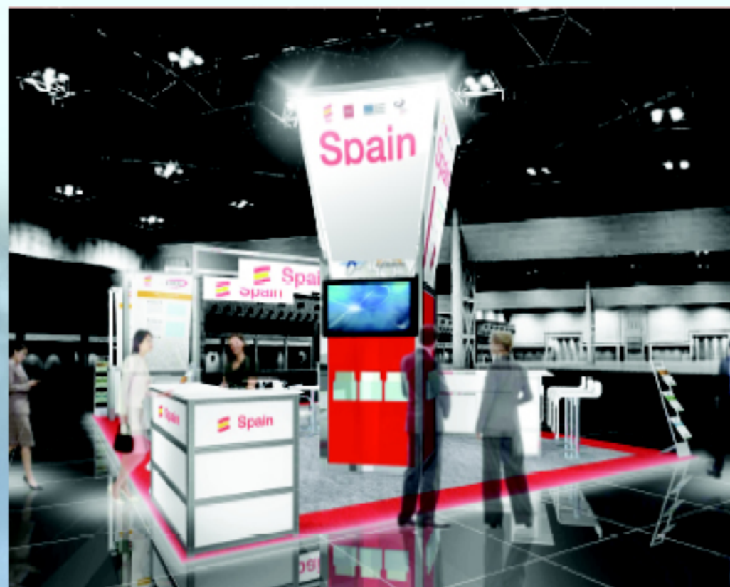
Spain pavilion Taipei World Trade Center Hall 1 (Taipei, Taiwan) – October 7-9, 2010