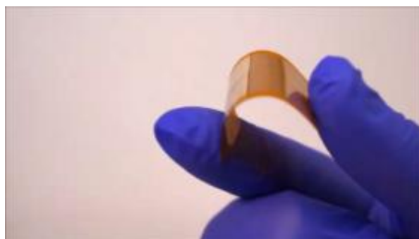
Figure 2: The flexibility of graphene based devices could be the enabling factor for applications in IoT.