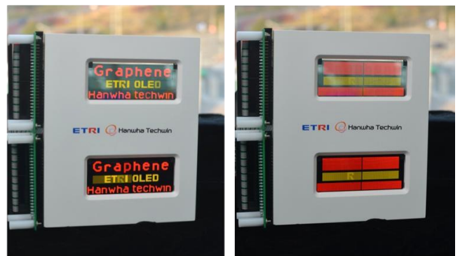
Figure 1: Pixelated graphene electrodes on the glass substrate imitating a display backplane and actual operating images of OLED panel based on it.