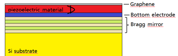
Figure 1: Schematic of a solidly mounted bulk acoustic wave resonator (SMR-BAW) with AlN as piezoelectric material and graphene as top electrode.